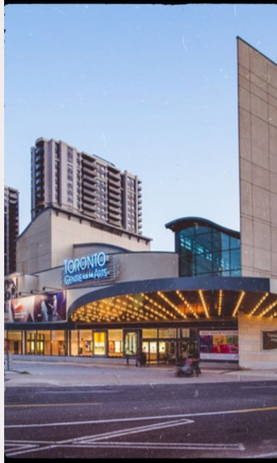
MERIDIAN ARTS CENTRE TORONTO