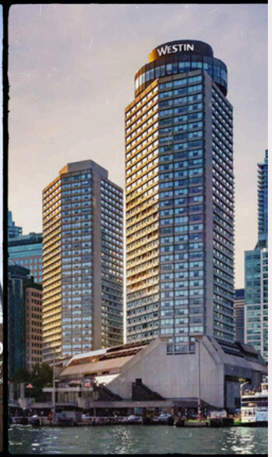
WESTIN HARBOUR CASTLE TORONTO